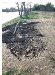
Post-construction erosion damage near Sac State